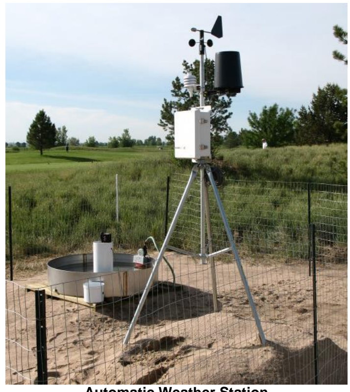
Automatic Weather Station

Additional sensor options include evaporation, soil moisture, water level, gas detection, and others. The unique modular system design provides simple menu selections for adding or replacing sensors. The WS-NL32 Data Acquisition Module features The logger software for data collection, logging, communications, diagnostics, and a menubased user interface for operating these features.