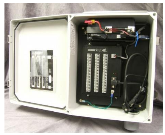
195-NL32 Data Logger